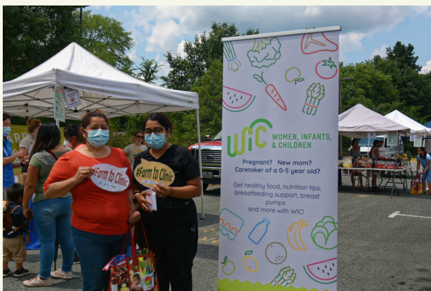
Taking a photo after a successful day of shopping!