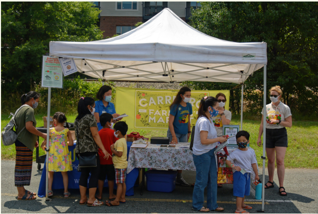
WIC FMNP customers at information booth to receive Double Bucks