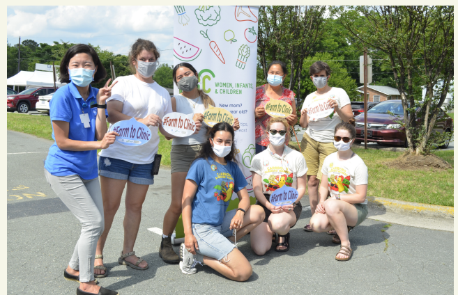
CFM and PHS staff after the Farm to Clinic Pop-Up Market

Carrboro Farmers Market Hours Wednesday: 3P.M. - 6P.M. Saturday: 7A.M. - 12P.M.