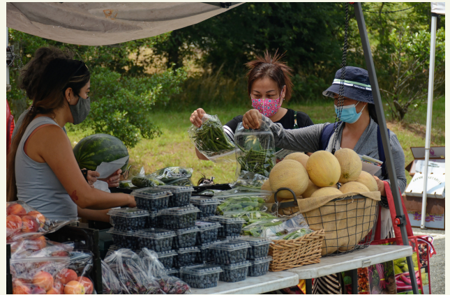
Buying fresh fruits and vegetables at Lyon Farms