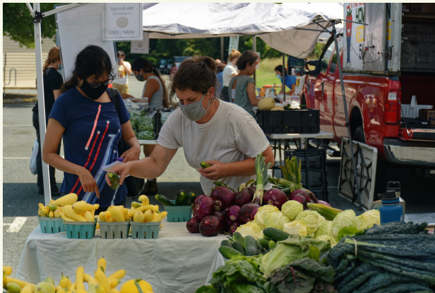
Picking out squash at Eco Farm