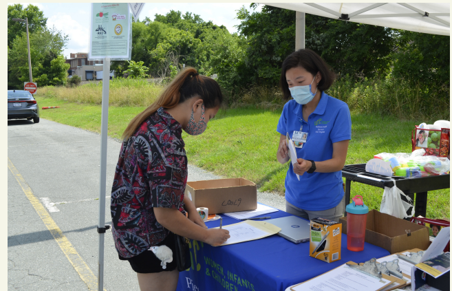
PHS WIC Nutritionist assisting customer with post-market survey