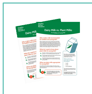
Dairy Milk vs. Plant Milks Decision Tools