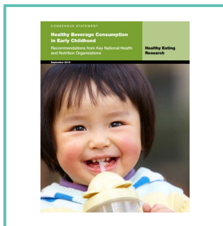
Consensus Recommendations, Full Report, and Summary

You can find downloadable versions of the following provider materials, handouts, graphics, and other resources at HealthyDrinksHealthyKids.org/professionals . Some of these materials are also available in Spanish and Tagalog.