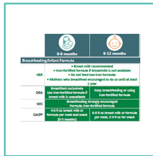
HER Guidelines Compared to Other Age 0-5 Beverage Recommendations