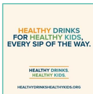
Social Media Graphics