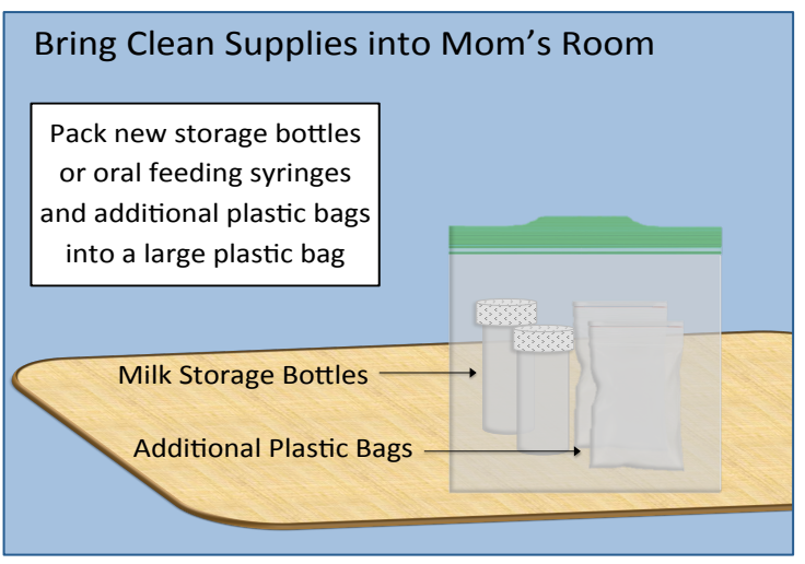
Figure 1. Supplies

*Please note, The Bottle Transfer Technique is the preferred method for transferring milk to baby.